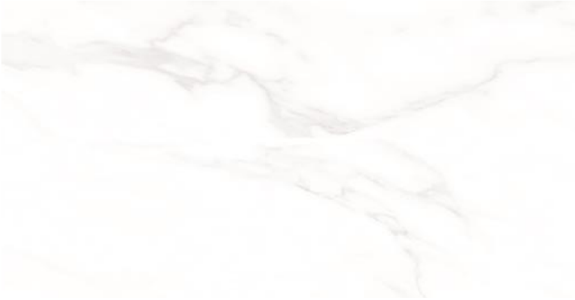
Wilbur White/ Light Grey