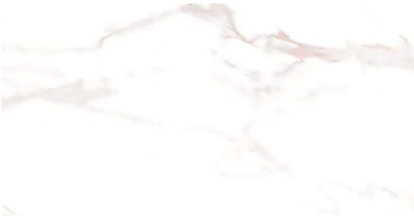
Wilbur White/ Gold

Stone look porcelain tile sizes: 12" x 24", 24" x 24", 24" x 48"